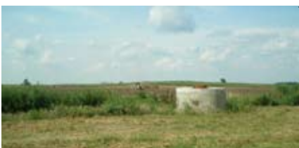
Base of elevated viewing deck.