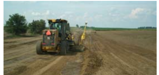
G.P.S. controls large earth movers.