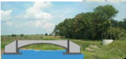
Pedestrian Bridge A "signature" structure of the park plus the key to erosion control.